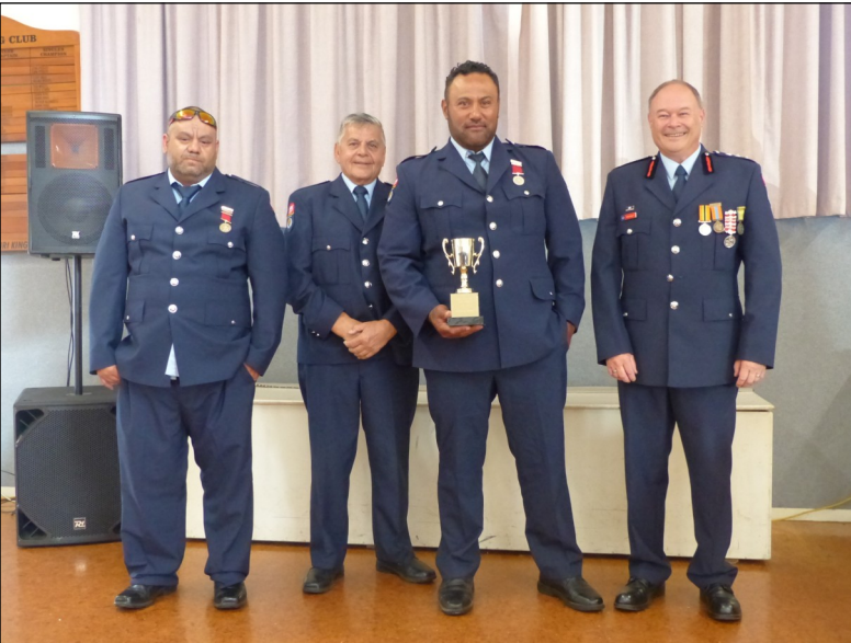
Left: The Top Team