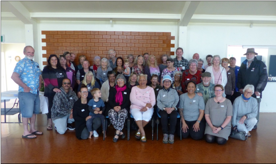
Above: A group photo was taken to record this special occasion.