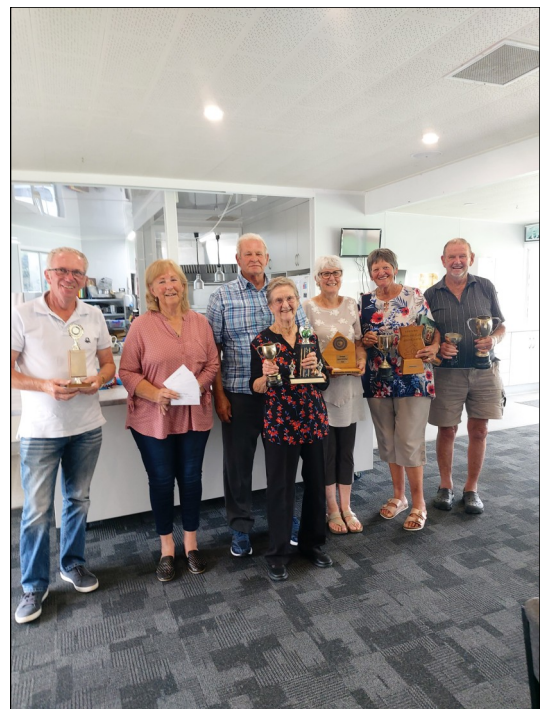
Above: Karikari Indoor Bowls Award Recipients for 2021. Congratulations!

Keep an eye on the Panui Facebook page for dates.