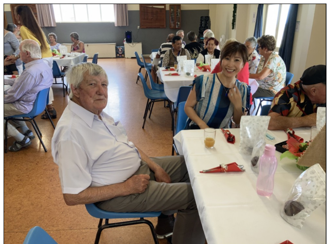
Above top and bottom: happy festive folk enjoying their afternoon together. Middle: The team who put the lunch together.

To enable the Fire Brigade and other emergency services to reach your property: